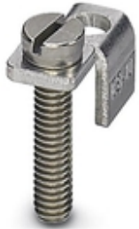
Chain bridge, pitch: 10 mm, number of positions: 1, color: silver

Please be informed that the data shown in this PDF Document is generated from our Online Catalog. Please find the complete data in the user's documentation. Our General Terms of Use for Downloads are valid ( http://phoenixcontact.com/download )